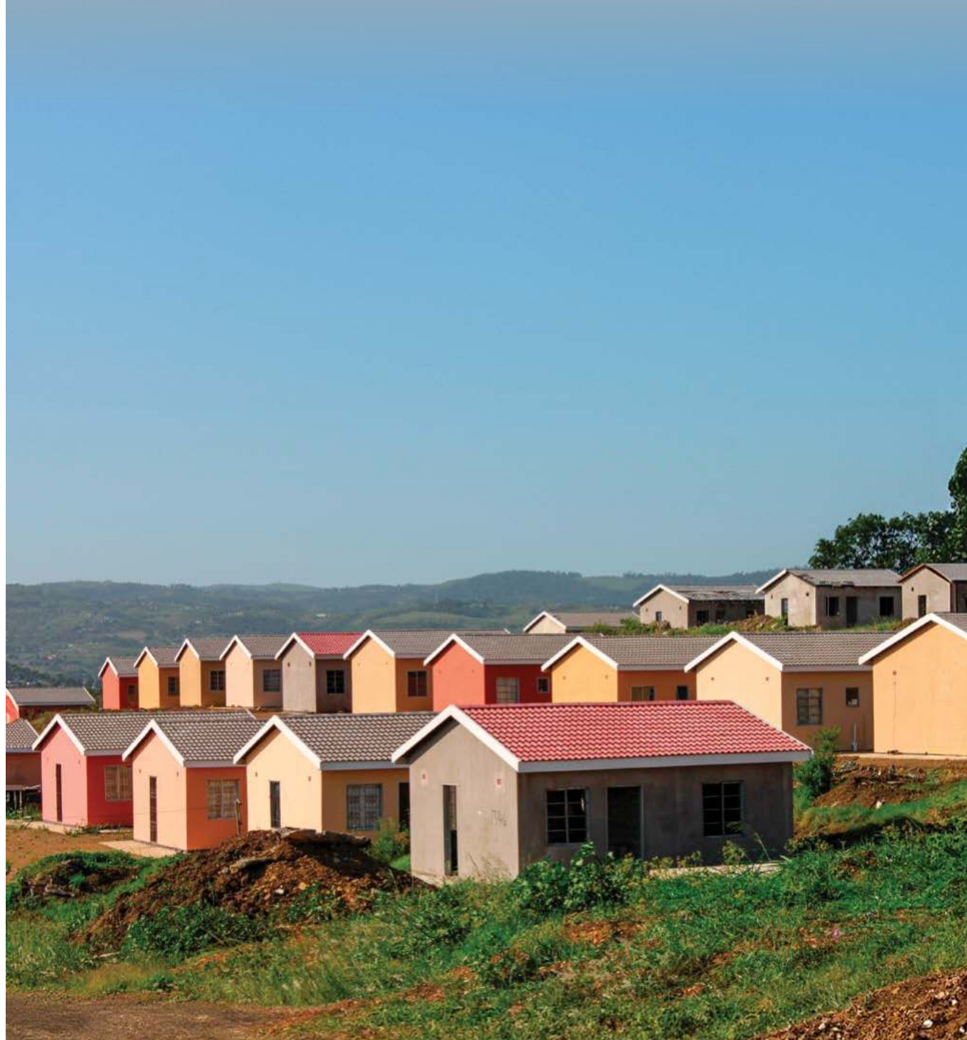
Photo: New affordable urban housing under construction in the Mandeni Municipality of South Africa's iLembe District of KwaZulu-Natal.

IFC has signed an advisory agreement with the government to address this shortage through structuring and implementing a public-private partnership that will help provide a variety of single-unit family dwellings and affordable flats. IFC will assist the government in running an open and competitive bidding process to identify a highly experienced private developer to design, finance, build, and maintain the housing for a defined period. This affordable housing project will not only help address a housing shortage and problems associated with informal settlements, but will also provide a stock of climate-resilient homes that incorporate green design specifications.