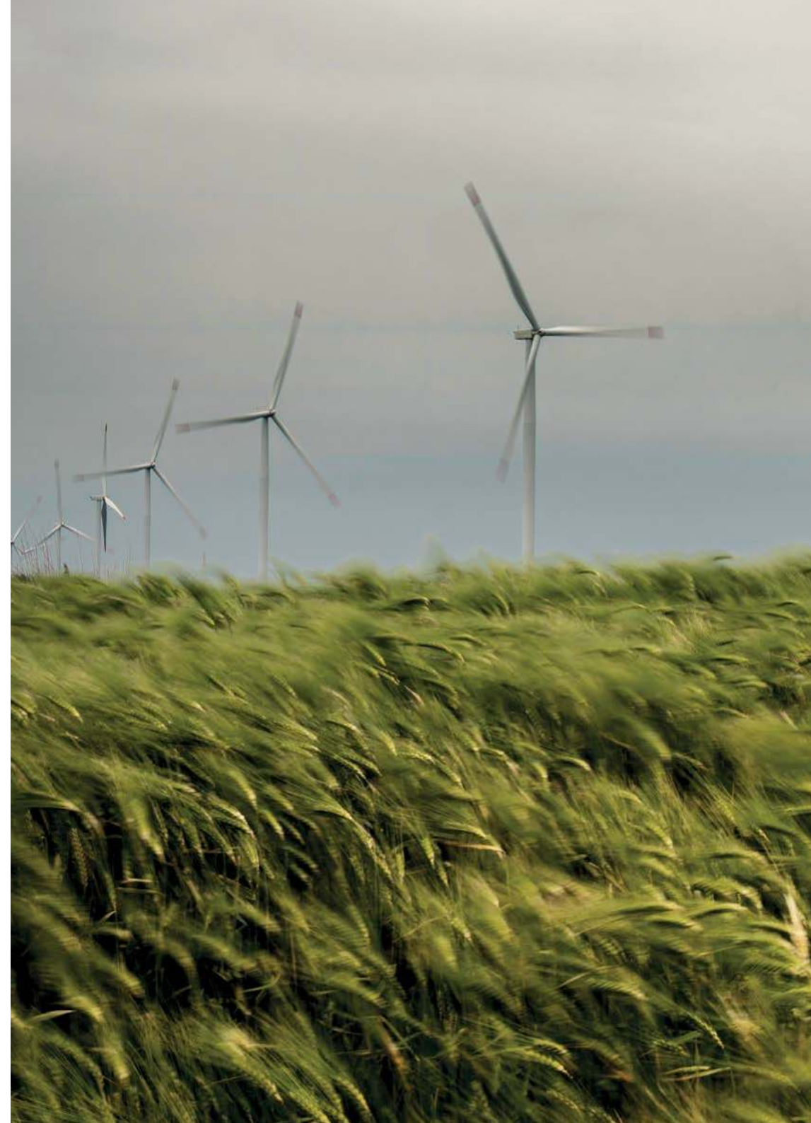
Photo: IFC-financed Cibuk 1 wind farm in the northern Serbian province of Vojvodina.

The report stresses the importance of de-risking for projects that involve newer technologies that have yet to scale and are not yet cost-competitive in many markets, such as battery storage, offshore wind, renewable-powered desalination, or low-emissions hydrogen. Projects using more traditional technologies but located in riskier markets will also require de-risking.