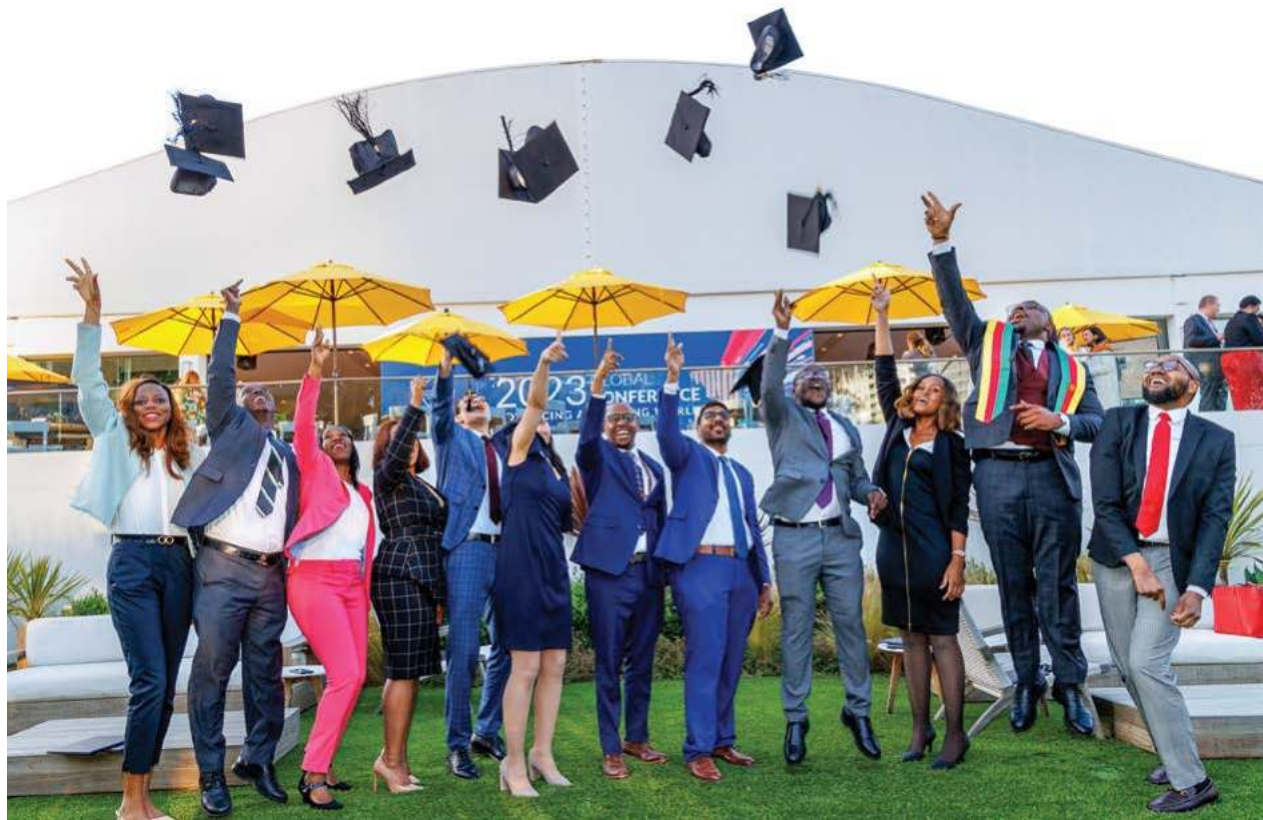
Photo: May 2023 graduation ceremony for the ninth cohort of the IFC-sponsored Capital Markets program.

The students spend about eight months in Washington, D.C., or in Paris, first completing a certificate program at the George Washington University or an executive master’s at Paris Dauphine, with courses on financial markets fundamentals, corporate governance, regulatory regimes, and other topics. Then they intern at investment banks, asset management firms, or international organizations like the World Bank Group.