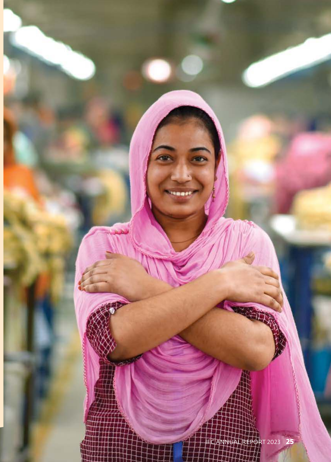
Photo: Bangladesh's garment sector employs more than 3 million women. A partnership between IFC and Levi Strauss & Co. helps factories identify and implement cleaner and more resource-efficient production options.

In this way, trade finance is central to turning the wheels of global commerce. By innovating to expand trade finance through partnerships like ours with BNP Paribas, IFC is supporting prosperity worldwide. Our guarantee agreement frees up capital to facilitate trade flows, keeping the engine of emerging economies running through uncertain terrain.