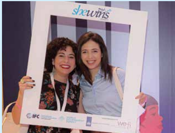
Photo: Now being replicated in Africa, IFC's She Wins Arabia initiative helps women-led startups across the Middle East and North Africa get the advice, mentorship, and financing they need to grow.

provide the next stage of investment for startups and small businesses with long-term growth potential, often providing technical or managerial expertise as well as investment.