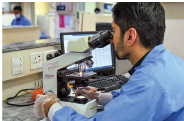
Photo: Northwest General Hospital and Research Center in Peshawar, Pakistan.

Our global focus on addressing the impacts of climate change is also evident in Pakistan, a country that is responsible for only 0.3 percent of global emissions but is disproportionately affected by extreme weather events such as floods and cyclones. We are looking to scale up support for sustainable and climate-resilient infrastructure while also supporting micro, small, and medium enterprises and strengthening capital markets. In addition to financial support, IFC provides advice on partnerships between the government and private sector to improve the country's water supply, hospitals, and airports. Through this support, a first-of-its-kind framework has been developed for airport outsourcing in the country.