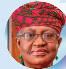
Ngozi Okonjo-Iweala WTO Director-General

the poorest and fragile and conflict-affected countries. In its first year, the initiative provided seven banks with trade finance lines totaling $75 million in countries such as Burkina Faso, Burundi, Guinea, and Mauritania. This included a $5 million facility for Interbank Burundi, supported by advisory services, and $10 million to bolster the growing trade finance business of Mauritania's Banque Mauritanienne de l'Investissement.