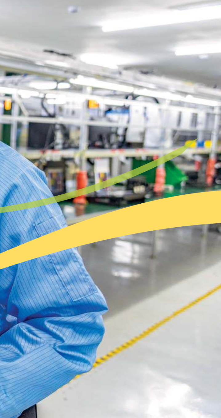
Photo: IFC financing helps Kenyan financial technology firm M-KOPA expand its flexible credit model, giving customers access to everyday essential products by paying a small deposit followed by digital micropayments.