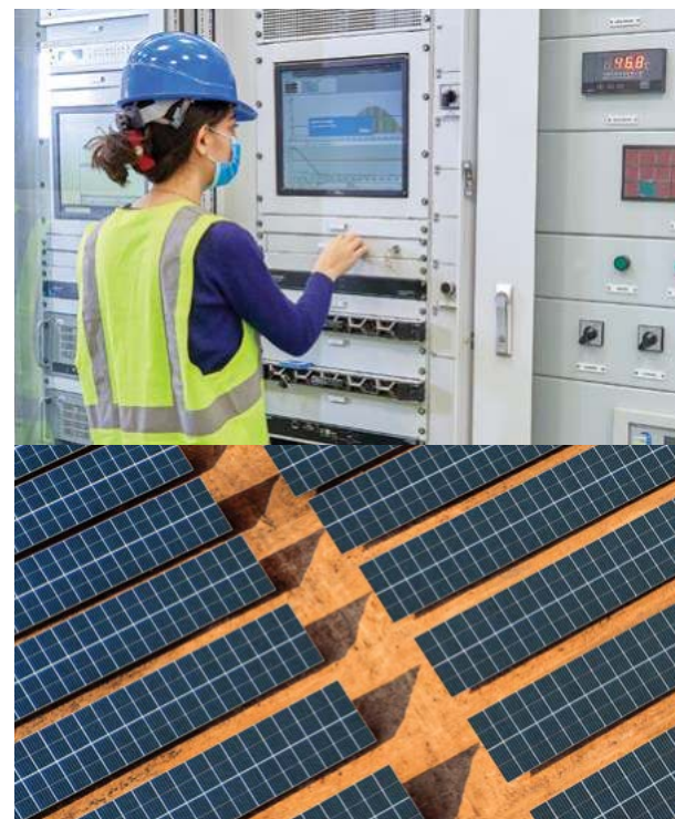
Uzbekistan’s Nur Navoi Solar field.

Uzbekistan is charting a new path for the Central Asia region—one powered by private expertise and investment in renewable energy. And with each new solar panel and wind turbine, Uzbekistan is bringing much-needed light and power to the region.